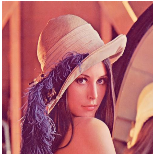
Figure 2. Standard picture used for our tests.

We have measured the performance of the algorithm on different GPUs and CPUs compressing the standard Lena. The design of the algorithm makes it insensitive to the actual content of the image. So, the performance depends only on the size of the image.